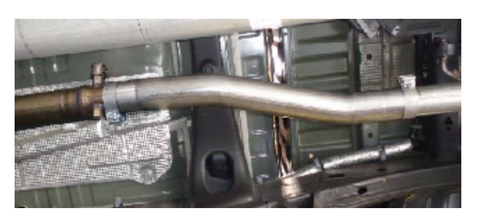
Step 4 . Once a final position has been chosen for the new exhaust system, evenly tighten all clamps from front to rear using the torque specifications on page one of the instructions. Inspect all fasteners after 25-50 miles of operation and re-tighten if necessary.

Step 3 . Slip supplied torca clamps on to the MagnaFlow Delete Pipe. Then Slip the MagnaFlow Delete Pipe on to the OEM Exhaust at the cut points.