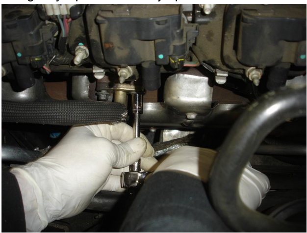
Step 3. Unbolt and remove the EGR pipe on the passenger side using a 10mm socket.