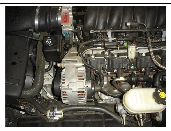
Step 7. Using a 15mm socket unbolt the alternator and remove. After alternator has been removed repeat passenger side process to remove the coil pack bracket.