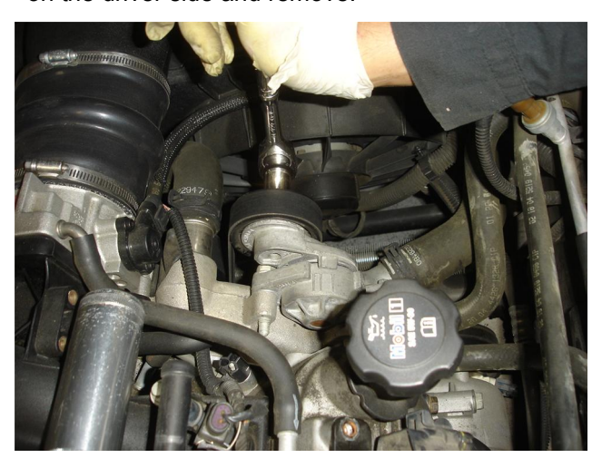
Step 6. Release the pressure on the drive belt tensioner with a 15mm socket and remove the serpentine belt.