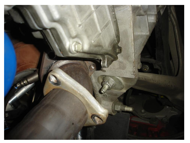
Step 8. Using a 15mm socket unbolt both catalytic converters from the OEM manifolds.