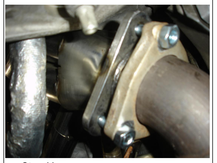
Step 11. Align the OEM converters up to the new headers and attach using the OEM nuts and bolts. Tighten the bolts to the manufacturers torque specifications. On the passenger side reinstall the EGR pipe, the dipstick assembly, the coil pack bracket, and then plug the spark plug wires back into the coils and plug. On the driver side reinstall the coil pack bracket. Then reinstall the alternator and serpentine belt. Next reinstall the EGR pipe. Reinstall the motor covers and battery enclosure. After all OEM parts have been reinstalled reconnect the battery.