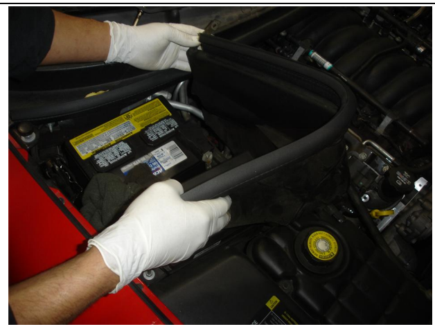
Step 1. Before removing the OEM manifold system, first disconnect the battery using a 10mm socket. Then remove the rubber battery enclosure to gain more access to the OEM manifold. Remove the engine covers by gently pulling to disengage it from the rubber grommets.