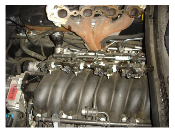
Step 9. Using a 13mm socket unbolt both manifold and remove. While removing both manifolds disconnect the O2 sensor plug. Unbolt and remove the O2 sensor cable from the OEM manifold using a 7/8" wrench and bolt it onto your new header assemblies.