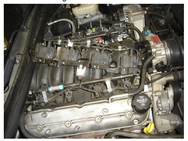
Step 2. Remove all spark plug wires from the coils and the plugs, and then set aside. On the passenger side unbolt the coil pack bracket using a 10mm socket and gently flip the assembly up towards the motor.