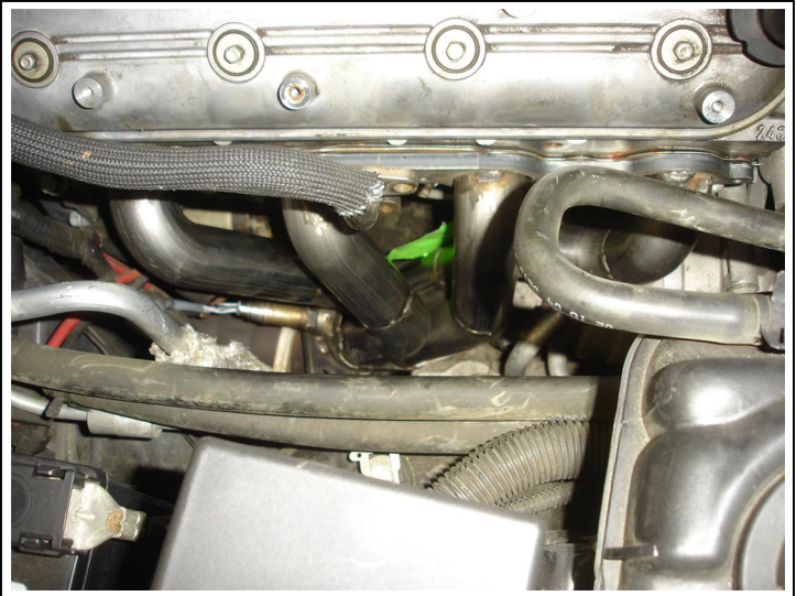
Step 10. Install your new header assemblies, plug in the O2 sensors before install, with the supplied gaskets and attach using the supplied header bolts with a 10mm socket to the manufacturers torque specifications.