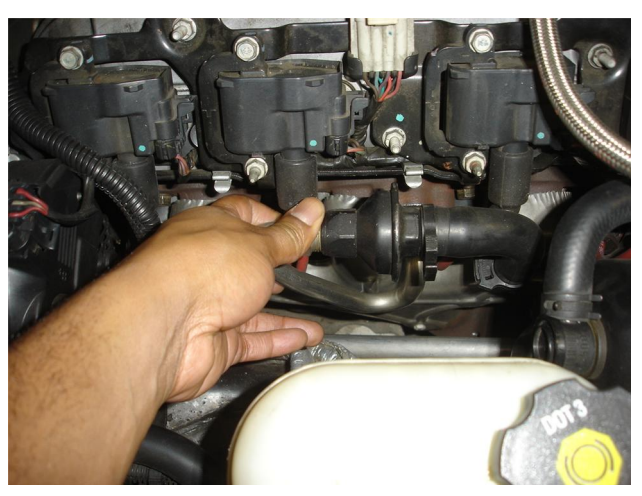
Step 5. Disconnect the hose from the EGR pipe on the driver side and remove.