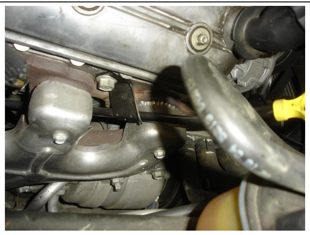
Step 4. Using a 15mm socket remove the dipstick assembly.