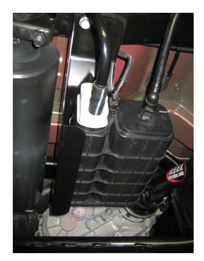
Now You Are Done! We are certain that this MBRPinc product will provide many years of enjoyment.