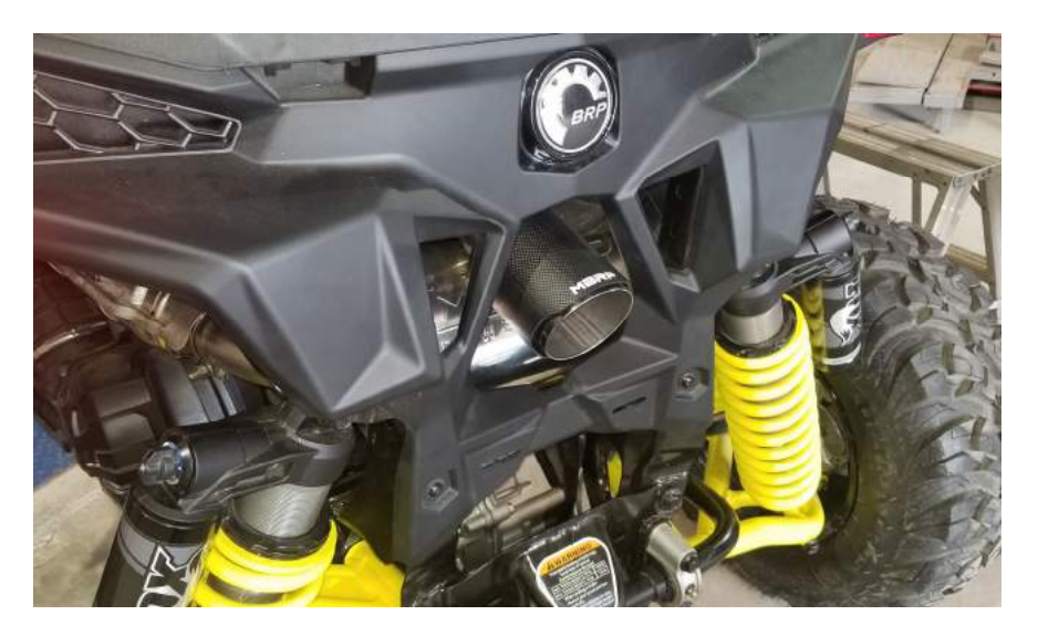
Congratulations! You are ready to begin experiencing the improved performance and driving excitement of your MBRP Ltd. Exhaust upgrade. We know you will enjoy your purchase.

It is recommended that the hardware be retightened after the first ride and checked periodically thereafter, tightening if necessary.