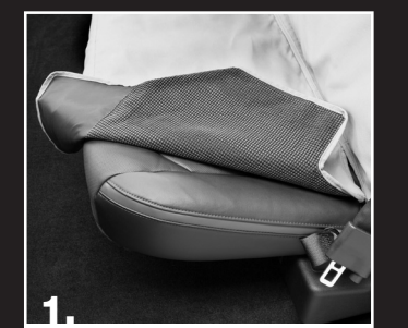
Unroll cover. Place seat bottom portion grippy side down and fold seat back portion over onto bottom portion. Ensure the half with straps is on top.