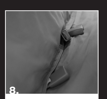
Pull the seatbelt buckles through, securing the hook and loop closures around the buckles.