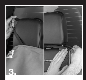
Unfold top half upwards to cover the seat back and secure the elastic straps around the headrests. (Skip to Step 7 if there are no child safety latches present)