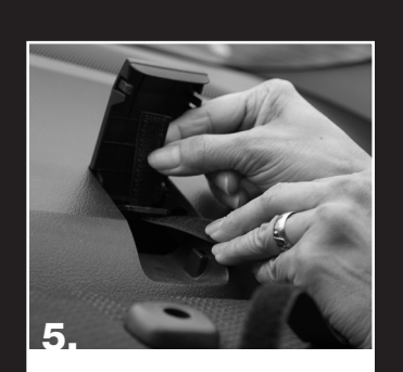
Thread attachments through latch behind each headrest.