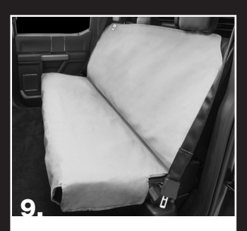
Finish installation by pulling the bottom portion of the Seat Protector around the seat bottom, draping it from the seat to the floor.