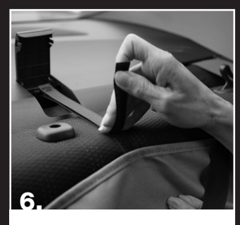
Secure hook and loop attachments once threaded through.