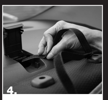
If vehicle is equipped with child safety latches, separate the hook and loop attachments at the top of the cover.