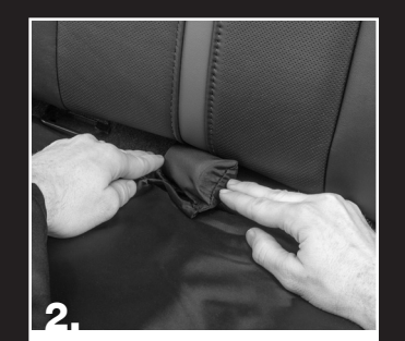
Insert foam attachments between seat cushion and seat back.