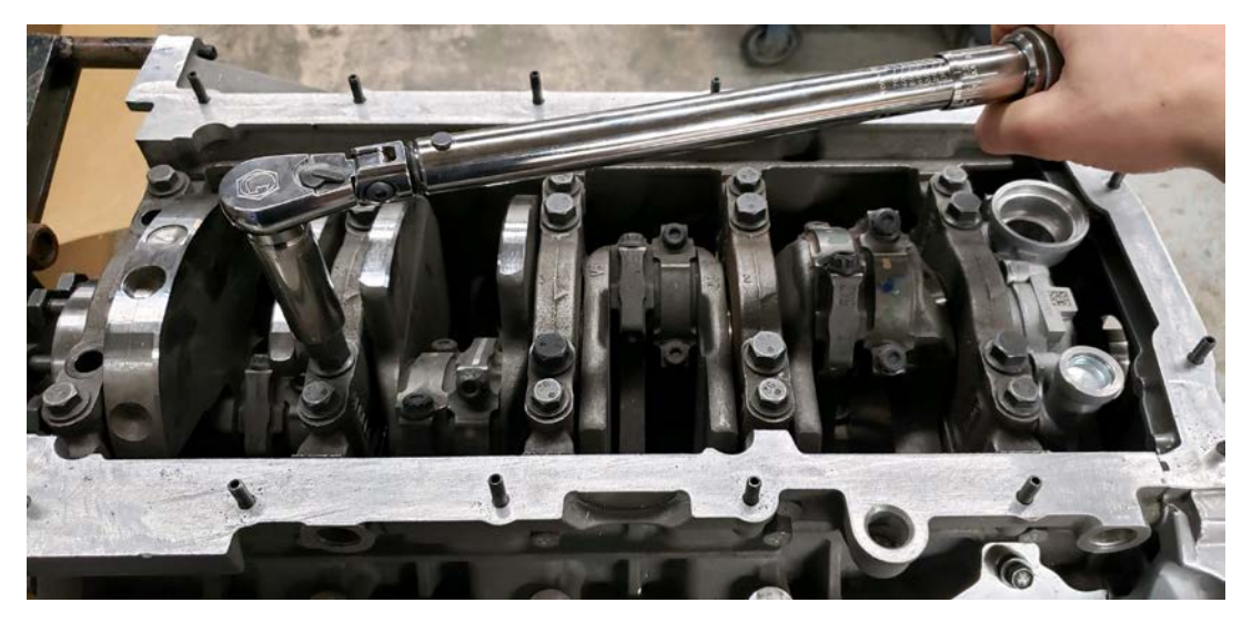
Step 5: Torque the standoff to 20 ft.-lbs.