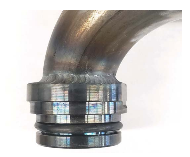
Step 6: Install the provided O-ring on the pickup and lubricate with engine oil before continuing.