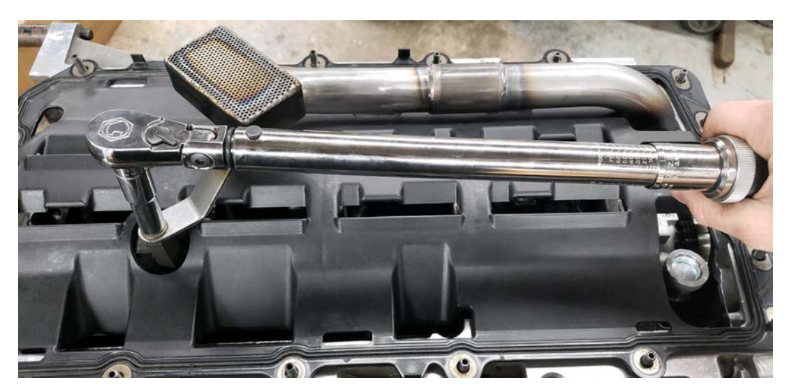
Step 9: Fasten the pickup bracket to the standoff using the provided 8mm flange head screw. Torque to 20 ft.-lbs.