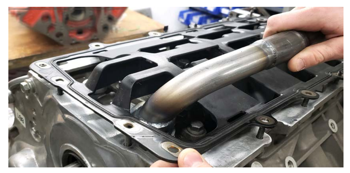
Step 7: Install the tray on the studs, and then lift the front of the tray while simultaneously inserting the pickup into the pump.