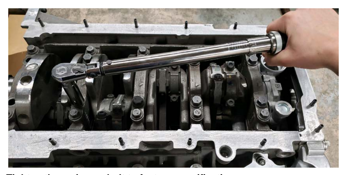
Step 3: Tighten the main cap bolt to factory specifications.