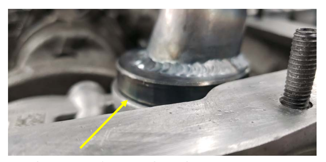
Step 8: Note: pickup must be fully seated in the oil pump.