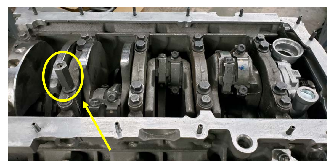
Step 4: Install the standoff.