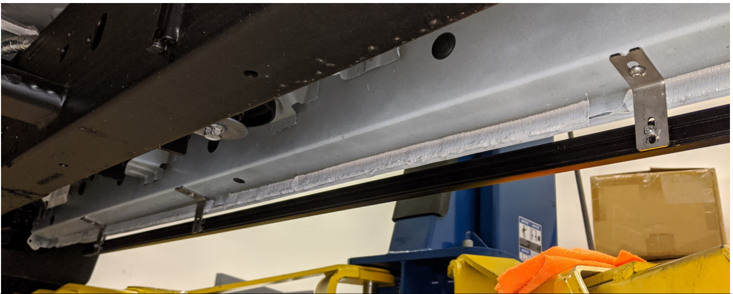
Figure 4. Extrusion mounting.