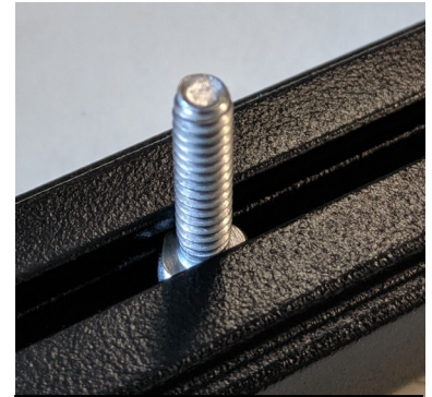
Figure 3. Mounting bolt in extrusion.