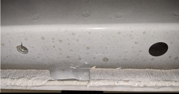
Figure 2a. Plug removal.