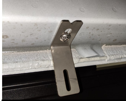
Figure 2b. Bracket mounting.