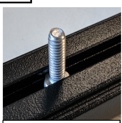
Figure 3. Mounting bolt in extrusion.