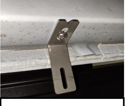
Figure 2b. Bracket mounting.