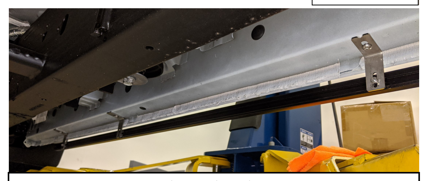
Figure 4. Extrusion mounting.

4. Route the black driver box and wires to a location safe from road debris, moving parts, and heat. Ziptie into place.