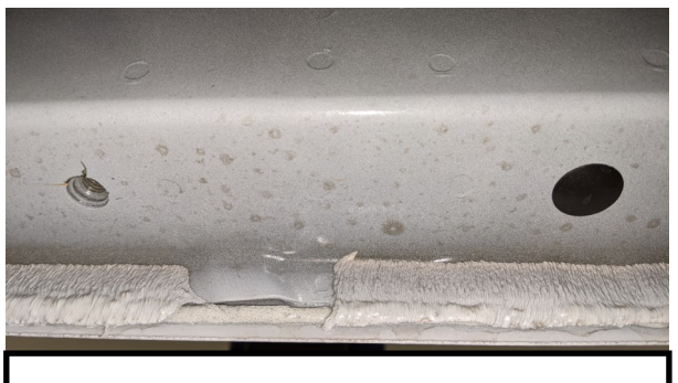
Figure 2a. Plug removal.

1. Remove the plug from three of the holes on each side and install the brackets using the six included M8 bolts and a 5mm Allen wrench shown in Figure 2a and 2b .