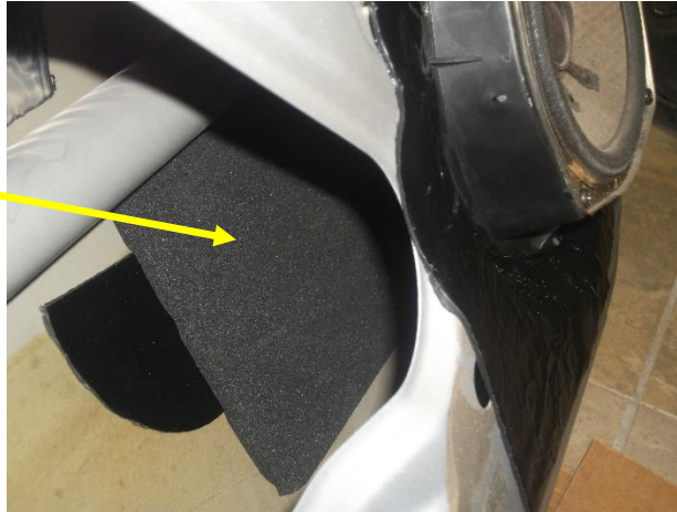
Wave Breaker Pad

NOTE: No HushMat material should come in contact with Speaker magnet once the installation is complete. In other words there will be an air gap between the magnet and the wave breaker.