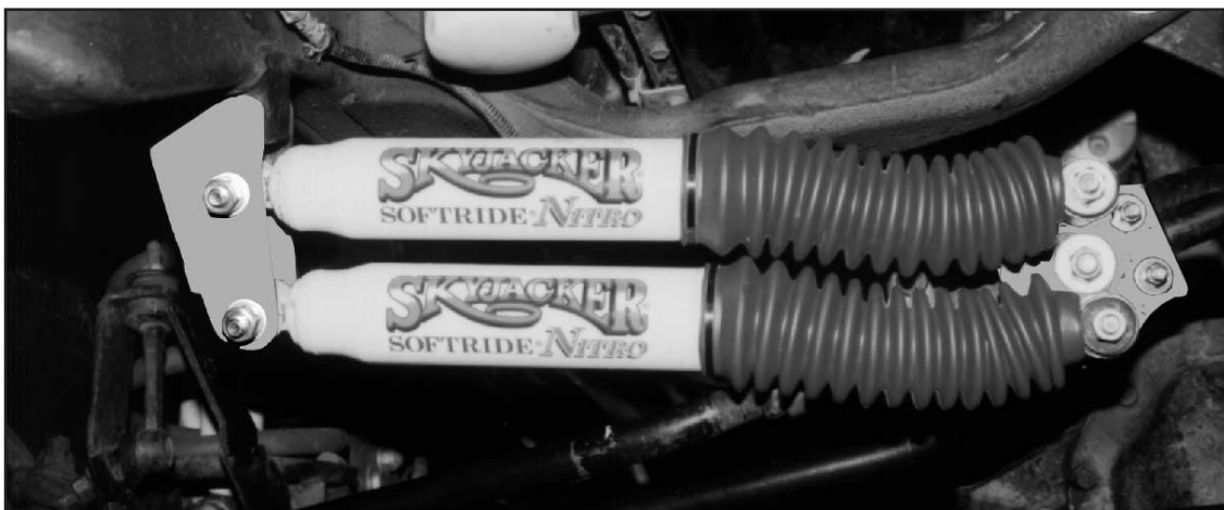
Dual Steering Stabilizer Available, #7217