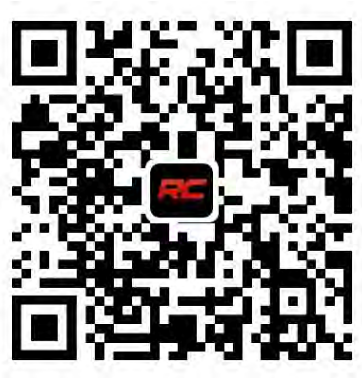
Download QR Code

Download RC Connect App for IOS and Android devices