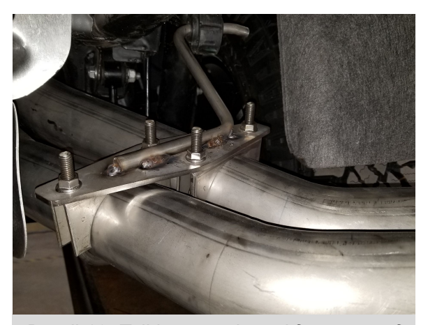
Detail 16: Tail hanger viewed from rear of vehicle.