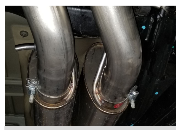
Detail 15: Muffler hanger orientation