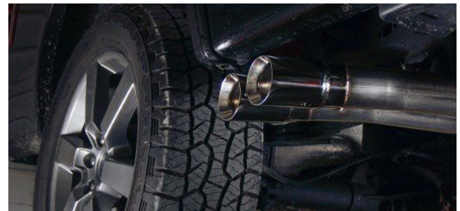
Detail 10a: Lightning Side-Exit Exhaust