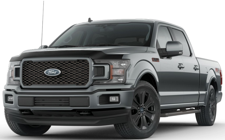
2015+ Ford F-150 (FT15CB, FT18CB)

Thanks for purchasing a Stainless Works catback exhaust system for your 2015+ Ford F-150. Our team has worked to ensure that this product is the premium in performance, quality, and fitment. We are proud to say that this system will unleash the true character of your vehicle. We encourage you to read through the following steps, and check the included Bill of Materials before beginning. Please follow these steps to ensure that your installation goes as planned.