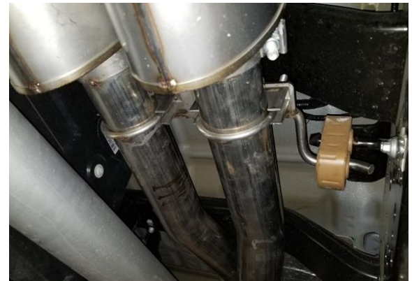
Detail 13: Inlet pipes to mufflers

20. After double checking for clearance and making sure all lines, wires and hoses are secured, drive the truck for 10-20 miles and re-check all clamps and clearances. Your system may be tack welded at the joints/ clamps to reduce shifting of the system during heating and cooling cycles. Make certain to disconnect the battery before performing any welding.