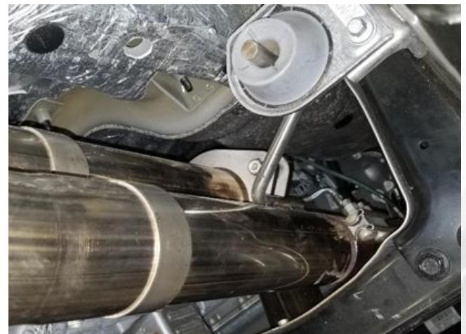
Detail 10: Inlet connection and X-pipe installed