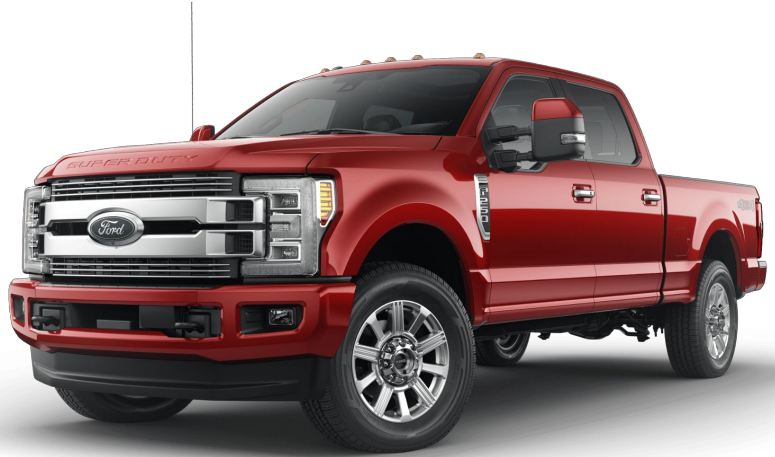
2017+ F250 6.2L (FT217CB)

Thanks for purchasing a Stainless Works catback exhaust system for your 2017+ Ford F250 6.2L. Our team has worked to ensure that this product is the premium in performance, quality, and fitment. We are proud to say that this system will unleash the true character of your vehicle. We encourage you to read through the following steps, and check the included Bill of Materials before beginning. Please follow these steps to ensure that your installation goes as planned.