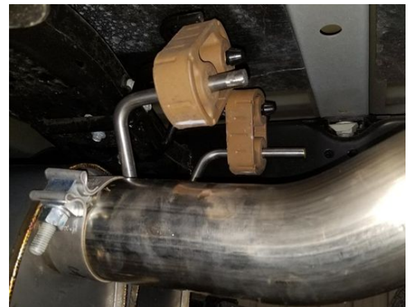
Detail 14: Muffler to tailpipe connection