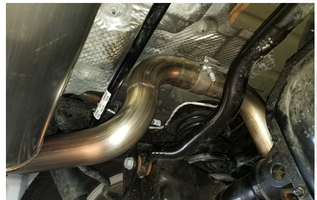
Detail 12: Muffler connection.