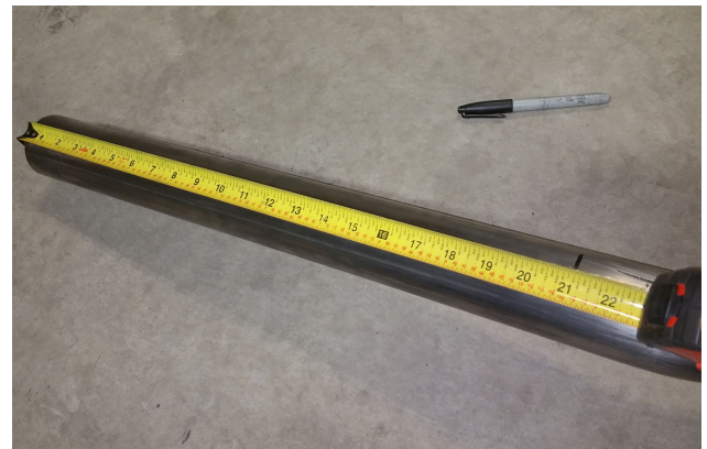
Detail 10a: 2 Doors only. Mark and cut 21" from mid pipe inlet.