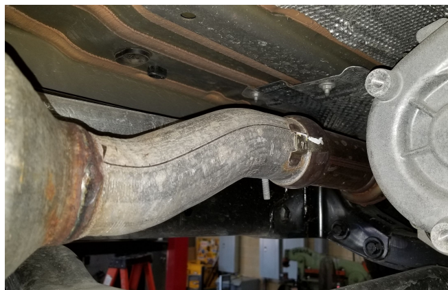
Detail 7: OEM catback connection