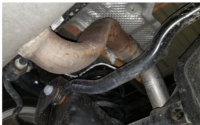
Detail 3: OEM axleback connection