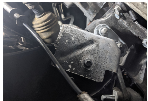
Detail 17: Motor mount heat shield