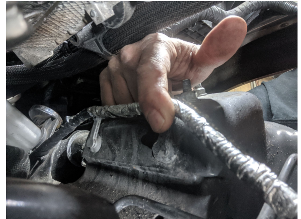
Detail 20a: Wire looms to be removed

29. Install passenger side lead pipe using (1) 3" clamp