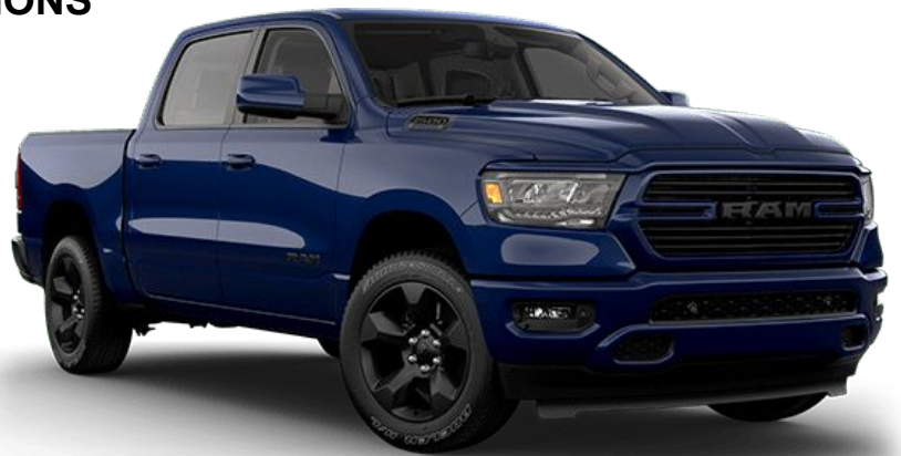
2019+ Ram 1500 (RAM19H)

Thanks for purchasing a Stainless Works Header system for your 2019+ Ram 1500. Our team has worked to ensure that this product is the premium in performance, quality, and fitment. We are proud to say that this system will unleash the true character of your vehicle. We encourage you to read through the following steps, and check the included Bill of Materials before beginning. Please follow these steps to ensure that your installation goes as planned.