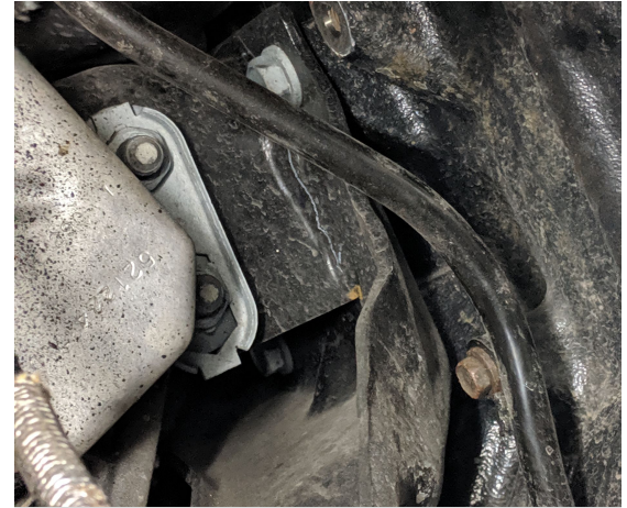
Detail 15: Lower dipstick tube bolt

Use the provided loop clamp and one of the 10mm nuts removed from the manifold heat shield to re-secure the shift cable to the stud. The loop clamp should be around the sleeve on the cable, between the flanged section