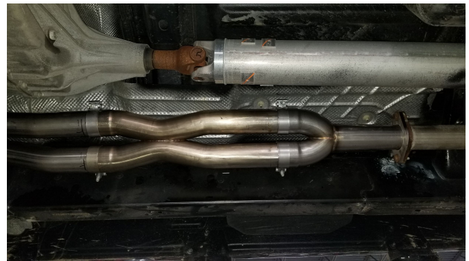
Detail 32: Factory connect configuration