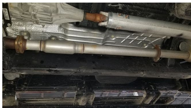
Detail 3: OEM mid section