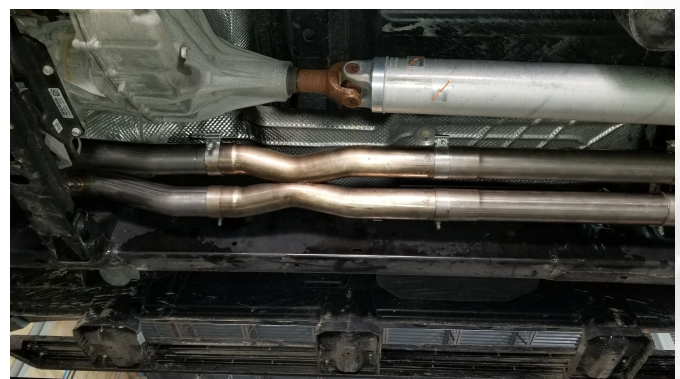
Detail 32b: Performance connect configuration