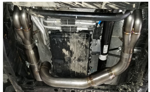
Detail 29: Headers and catted leads installed