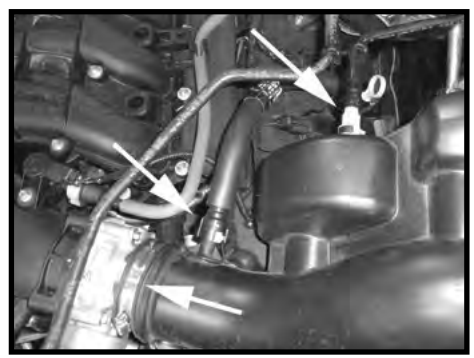
Step 2 Disconnect the PCV fresh air hose and vent hose from the intake tube. Loosen the clamp on the tube going to the throttle body.

Safety first! Before you begin the installation, make sure that the vehicle is in park (or neutral for a manual transmission) with the parking brake set. Disconnect the negative battery terminal and verify that all components that are listed are present. Note: This kit was designed and tested on a stock engine without any custom tuning done to the engine computer. Removing the battery cable may erase the programmed radio stations. The anti-theft code will need to be entered into some radios after the battery cable is connected. The anti-theft code can typically be found in the owner's manual or at your local dealership.