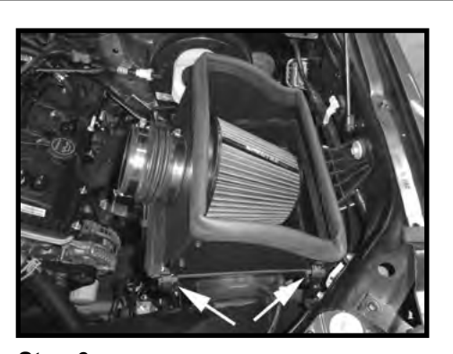
Step 6 Install the heat shield making sure that the tabs on the heat shield are inserted into the lower factory air box slots. With the heat shield located into the slots, using the 2 factory clips from the air box, clip the heat shield into position.