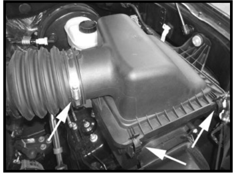
Step 3 Loosen the clamp at the air filter housing and then remove the intake tube from the vehicle. Unclip the two hold down clips on the air filter lid, lift the lid then slide it forward to clear the locking tabs. Remove the air filter lid and air filter.