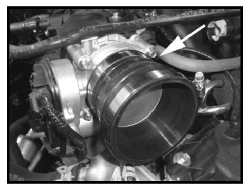
Step 7 Install the coupler on the throttle body and secure the coupler in place. Install a second clamp but do not tighten at this time.