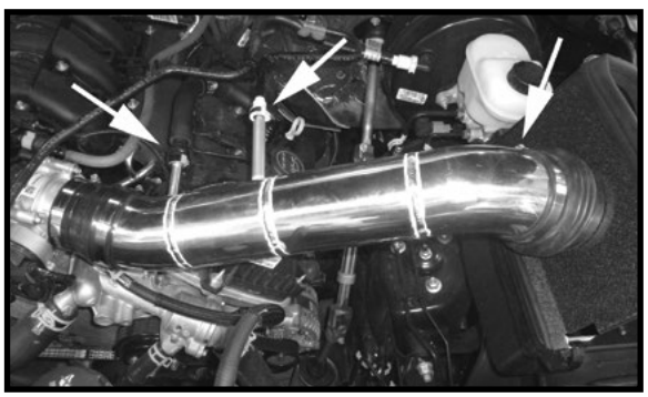
Step 8 Install the Spectre Performance intake tube into the flex coupler on the heat shield then into the coupler on the throttle body. Fasten securely in place. Reconnect the PCV hose and vent hose into the intake tube.