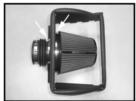
Step 5 Place the velocity stack adapter in the heat shield and install the supplied flex coupler making sure the coupler is pushed completely against the heat shield. Once the adapter and coupler are tight against the heat shield, tighten the clamp. Install the supplied air filter and clamp and tighten the clamp that secures the air filter.