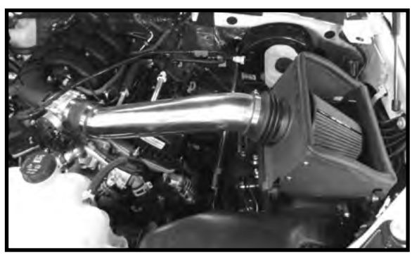
Step 9 Make sure that all clamps and hardware are fully tightened. Reconnect the battery cable and start the engine and let it warm up. Shut it off and inspect the installation once more for any loose clamps, wires, or hardware. Test drive & enjoy! Your installation is now complete. Periodically check all clamps and brackets.