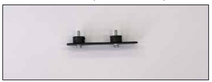
14. Install the bracket assembly onto the front air box mount as shown.