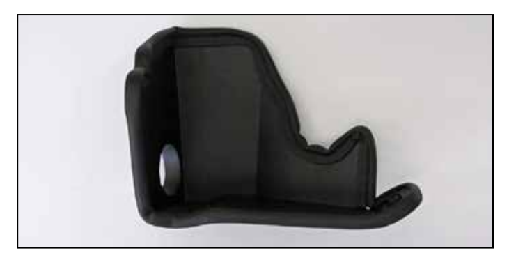
17. Install the provided edge trim onto the heat shield as shown.