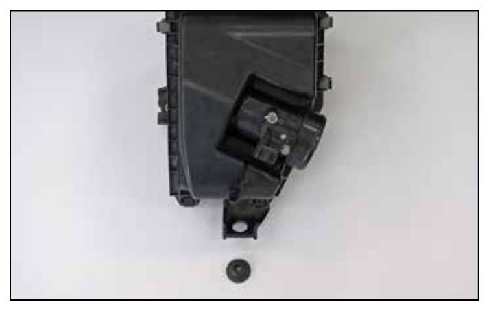
15. Remove the mounting grommet from the air box as shown.