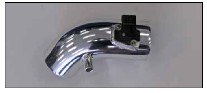
20. Install the mass air sensor into the Spectre<sup>®</sup> intake tube and secure with the provided hardware.