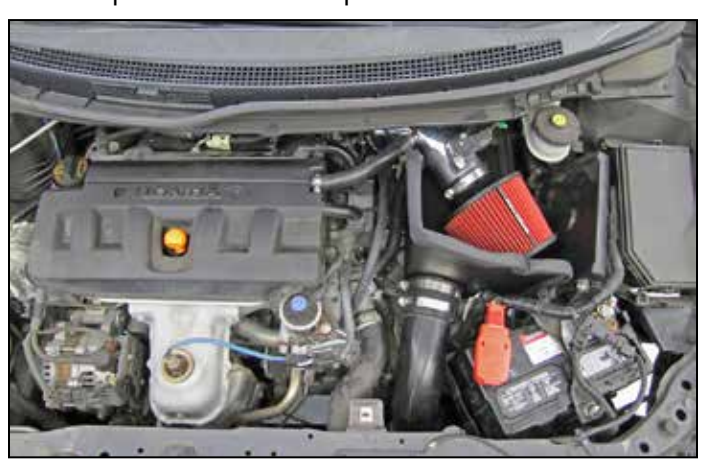
26. Make sure that all clamps and hardware are fully tightened. Reconnect the battery cable, start the vehicle and let it warm up. Shut off and inspect the installation once more for any loose clamps, wires, or hardware. Test drive & enjoy! Your installation is now complete. Periodically check all clamps and brackets.

If you need any assistance please call 1-800-858-3333 to speak with a representative in our Customer Service Center before returning the product.