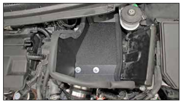
19. Remove the two screws securing the mass air sensor and then remove the mass air sensor from the factory air box.