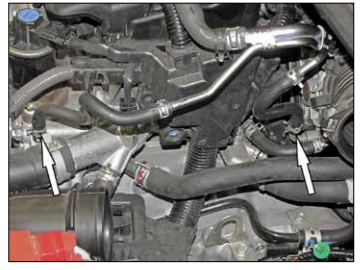
8. Release the spring clamps securing the coolant by-pass hose connections to the engine and then disconnect the coolant by-pass hose and remove the by-pass hose/crank case vent pipe assembly.

NOTE: be sure the engine is cool before attempting to remove the coolant by-pass hose. Be sure to collect any lost coolant and replenish into the cooling system once the install is complete.