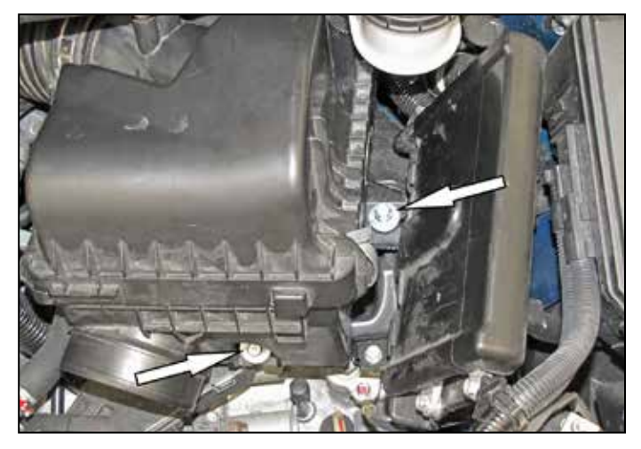
4. Remove the two bolts retaining the air box.