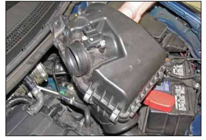
6. Disconnect the mass air sensor electrical connection and then remove the complete air box assembly.