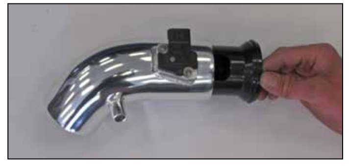
21. Install the mass air sensor insert into the Spectre® intake tube as shown.

NOTE: The insert will slide completely into the tube once installed properly.