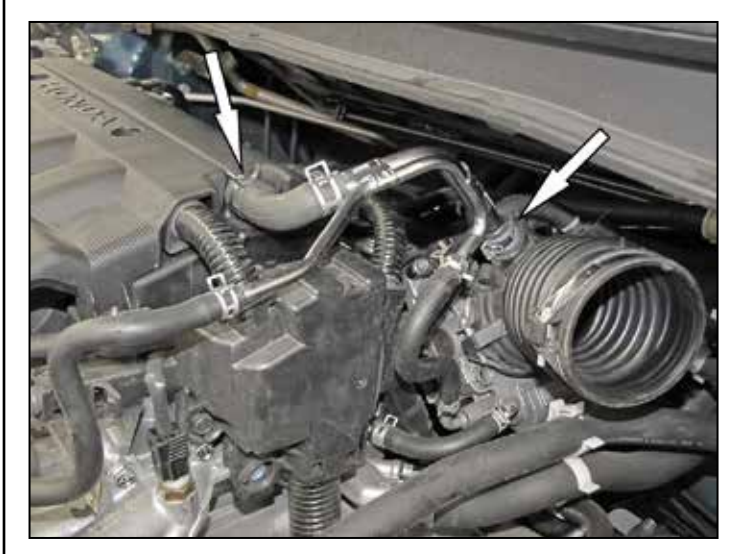
7. Release the spring clamps securing the crank case vent hose connections to the valve cover and intake hose, and then disconnect crank case vent hose connections.