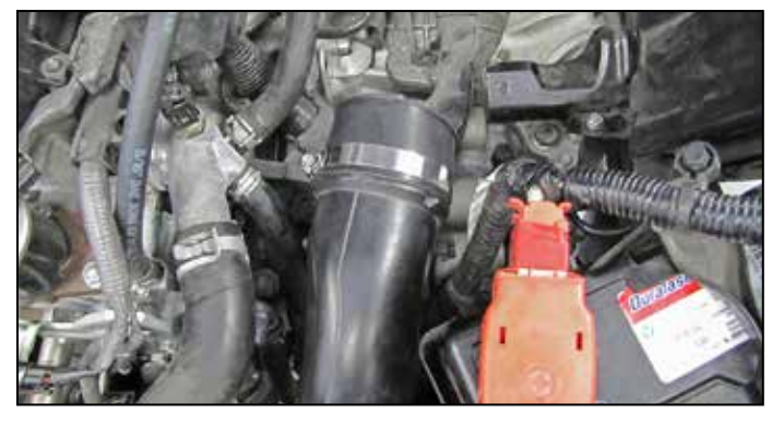
12. Install the coupler silicone hose onto the fresh air duct and secure with the provided hose clamp.