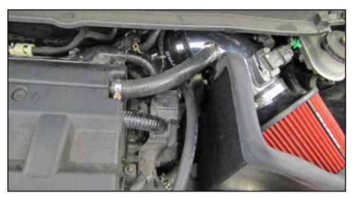
25. Install the provided crank case vent hose and secure with the provided hose clamps.