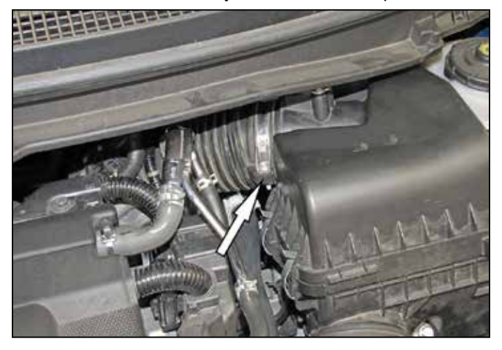
2. Loosen the hose clamp securing the intake tube to the air box and then disconnect the tube from the air box.

NOTE: This kit was designed and tested on a stock engine without any custom tuning done to the engine computer. Removing the battery cable may erase the programmed radio stations. The anti-theft code will need to be entered into some radios after the battery cable is connected. The anti-theft code can typically be found in the owner's manual or at your local dealership.