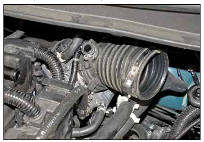
10. Loosen the hose clamp securing the intake hose to the throttle body and remove the intake hose from the throttle body.