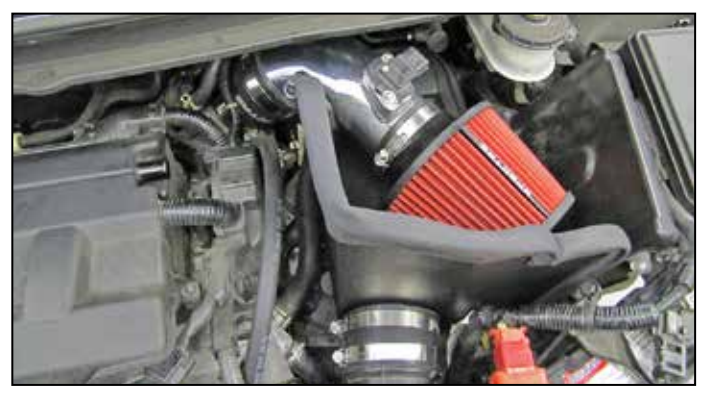
23. Install the air filter onto the intake tube and then adjust the intake tube and filter for best fit. Secure the intake tube and filter with the provided hose clamps.