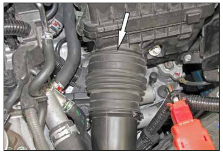
3. Disconnect and remove the fresh air hose from the air box and fresh air inlet, then remove the hose from the vehicle.