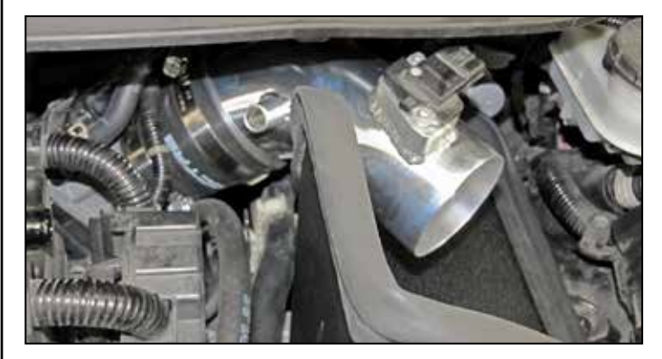
22. Install the intake tube assembly into the coupler hose at the throttle body, do not completely tighten the hose clamps at this time.