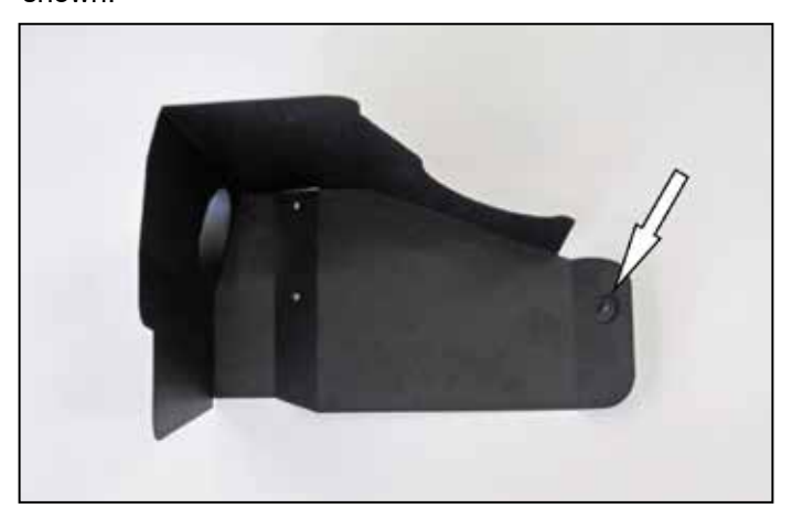
16. Install the mounting grommet into the heat shield as shown.