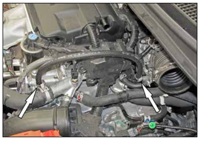
9. Install the provided coolant by-pass hose and secure with the provided hose clamp.

NOTE: be sure the engine is cool before attempting to remove the coolant by-pass hose. Be sure to collect any lost coolant and replenish into the cooling system once the install is complete.