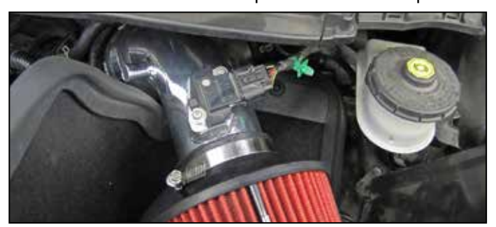
24. Reconnect the mass air sensor electrical connection.