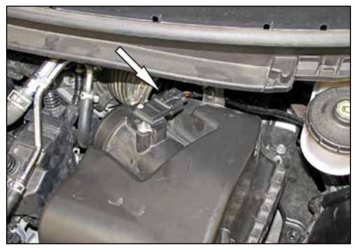
5. Lift the air box up to release it from the mounting grommet and then pull it forward to gain access to the mass air sensor connection.