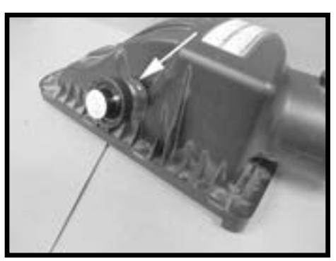
Step 6 Remove the filter minder and grommet from the air box lid.

Step 5 Remove the 2 screws securing MAFS from the air box lid. Then remove the sensor from the air box.