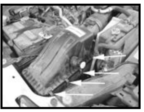
Step 3 Unclip the four hold down clips on the air box lid.

Slide the red clip back then disconnect the electrical connector at the Mass Air Flow Sensor (MAFS). Unclip the wiring harness from the air box lid.