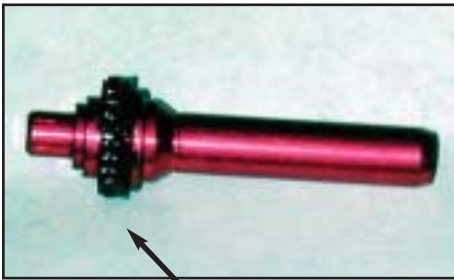
Remove seal from piston.