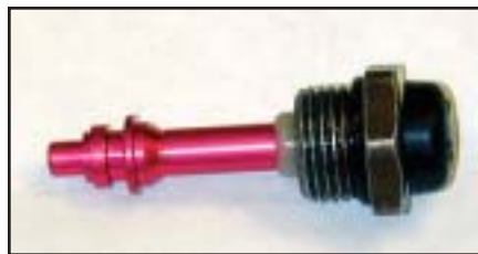
Push piston into endnut.