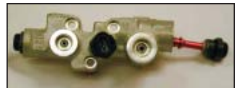
Replace piston and endnut.