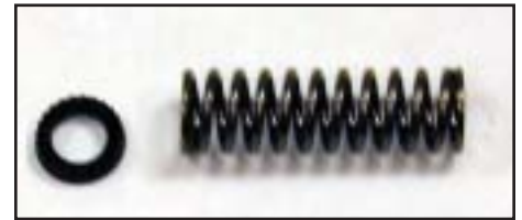
Put these parts aside.