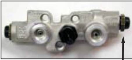
Remove this nut from valve body.

NOTE: When you remove this nut, brake fluid will leak out. Make sure you keep fluid in the master cylinder at all times.