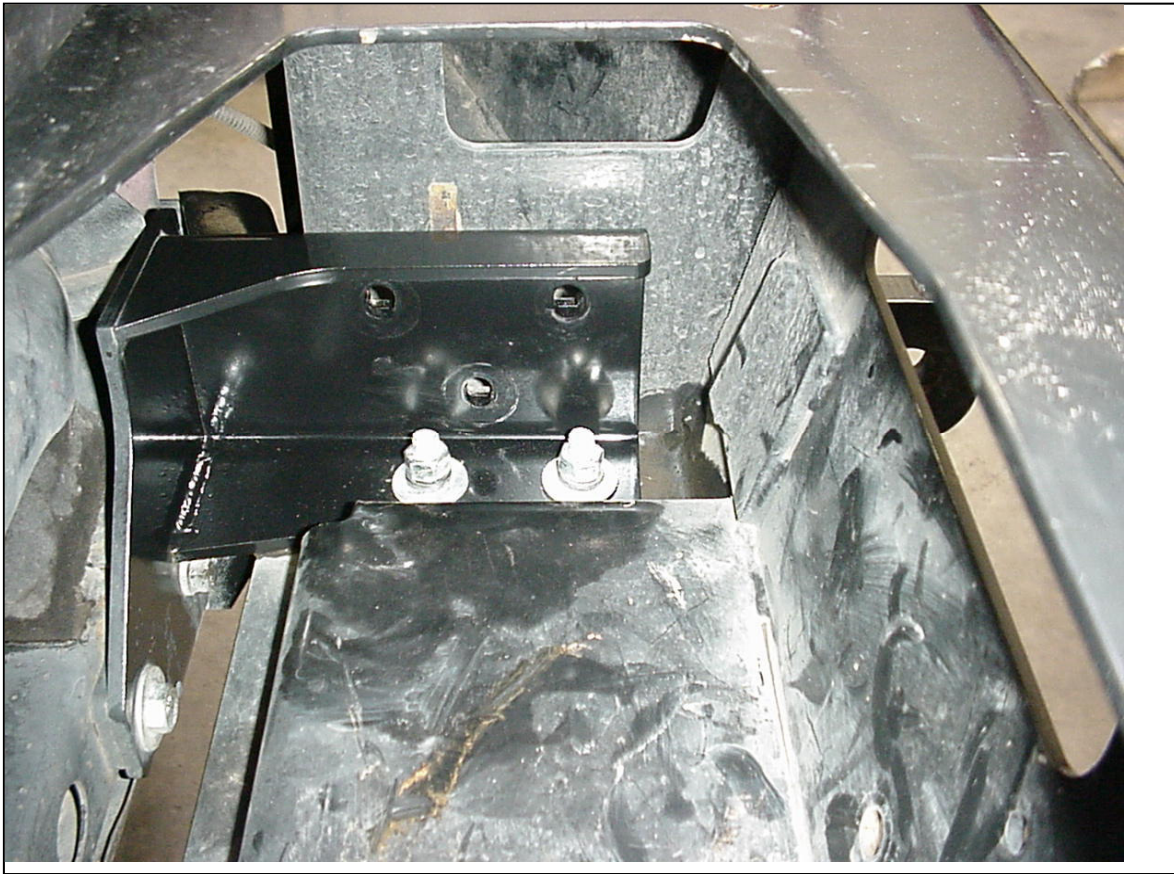
FIGURE 3, BUMPER INSTALLATION USING BOTTOM HOLES IN FRAME BRACKETS.