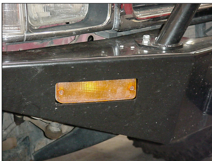
FIGURE 2, TURN SIGNAL INSTALLATION.