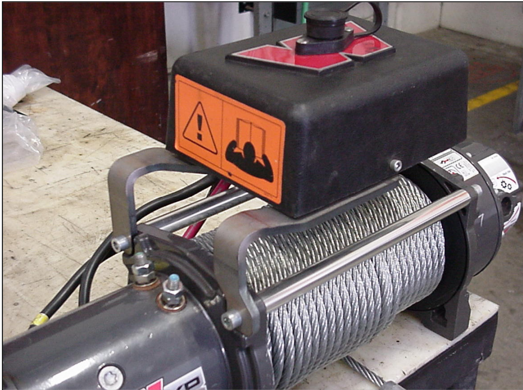
FIGURE 6, SOLENOID BOX MOUNTING BRACKET.