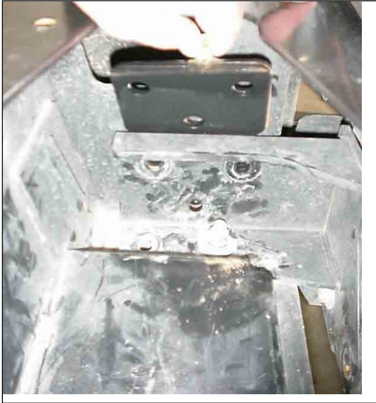
FIGURE 4, SHIM PLATE INSTALLATION.