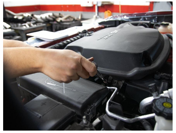
5. Loosen the throttle body clamp using an 8mm socket and ratchet.