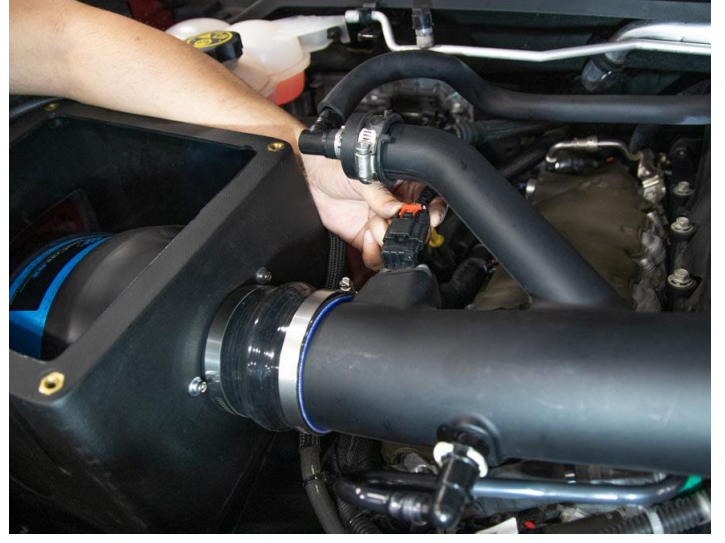
13. Insert the factory MAF sensor harness into the MAF sensor by pushing it firmly. Make sure to clip the red locking tab until a click is heard.

14. Tighten all the clamps using an 8mm socket and ratchet until the assembly is secure.