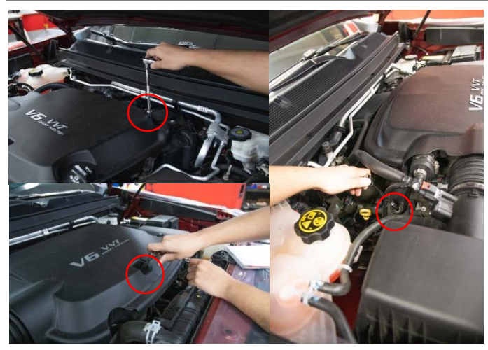
1. Use a 10mm socket and ratchet with extension to remove the three bolts shown above.