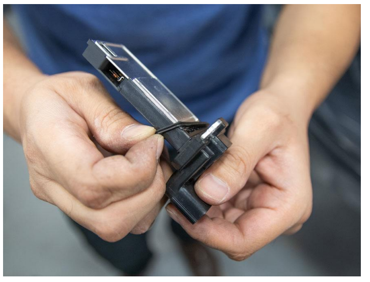
12. Remove the factory MAF sensor gasket shown above and place it aside. Keep the MAF sensor for use with the Volant Air Intake.

This concludes the removal of the factory intake.