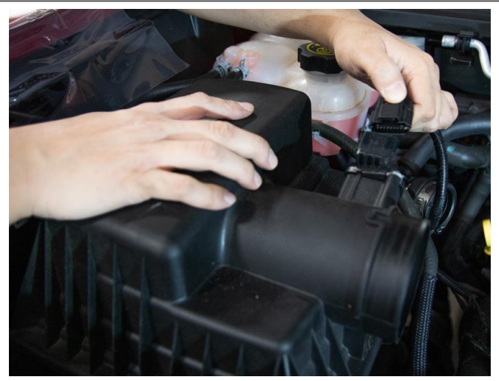
Unclip the factory MAF sensor harness by pulling on the tab till it clicks and then pressing it and pulling it as the same time.