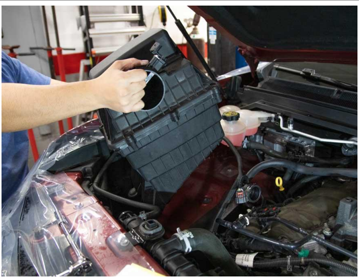
10.Gently remove the factory airbox as shown and place it aside.