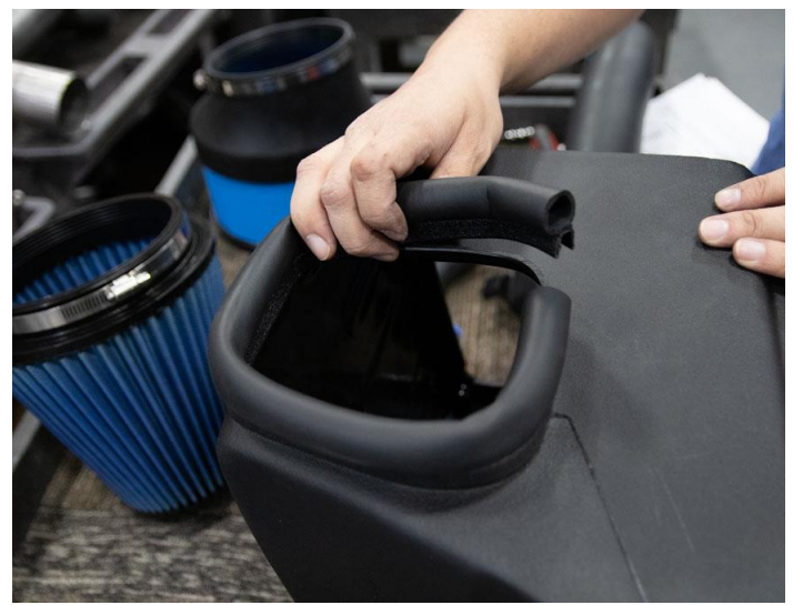
3. Insert the provided Bulb Seal to the Volant airbox as shown.

2. Use the two Philips head screws and screw the MAF sensor to the duct securely.