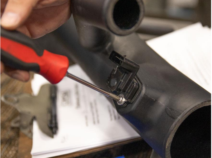
Insert the MAF sensor into the duct as shown with the MAF sensor gasket provided sandwiched between the MAF and the Duct.

2. Use the two Philips head screws and screw the MAF sensor to the duct securely.