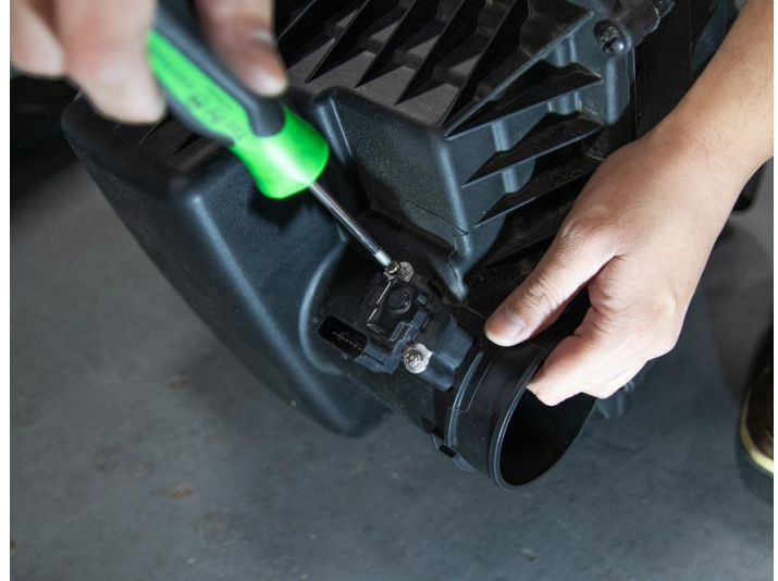
11.Remove the 2 Torx screws holding the factory MAF sensor using a T-20 Torx screwdriver.