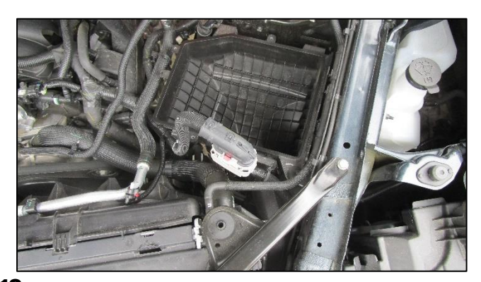
10. Lower factory air box remains in vehicle and is used with Volant air intake.