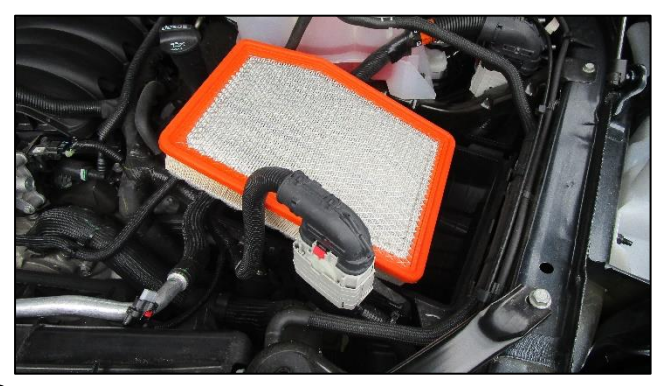
9. Remove factory air filter from lower air box.