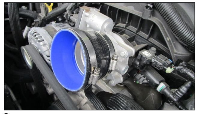
6. Place reducer onto throttle body with included #56 clamp on smaller diameter. Place included #64 clamp on larger diameter.

4. Install Volant air box onto lower portion of factory air box in vehicle. Using the three factory screws from removal step 7, secure Volant air box with a ratchet and 8mm socket with extension.