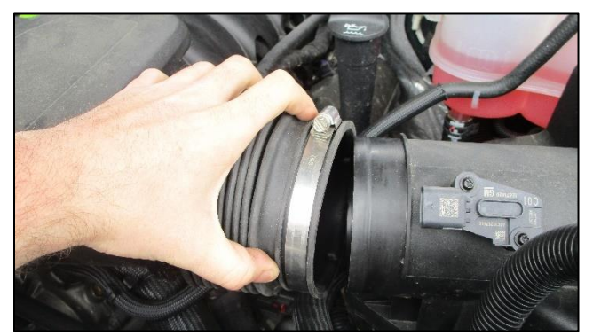
5. Pull air duct bellows from air box. Remove air duct from throttle body.

3. Loosen clamp securing factory air duct to throttle body with a ratchet and 8mm socket.