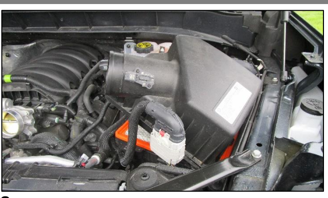
8. Remove upper portion of factory air box.