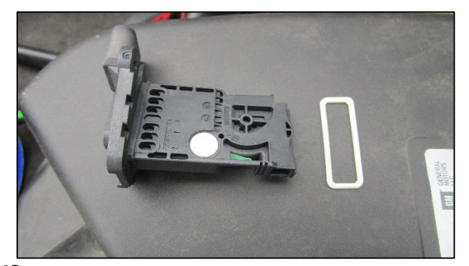
12. Remove factory gasket from MAF sensor.

This concludes the removal of the factory intake.