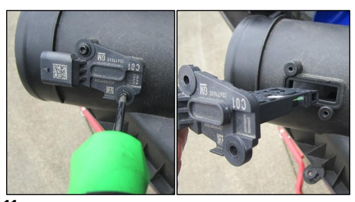
11. Remove two screws securing MAF sensor with a T20 Torx driver. Remove MAF sensor from factory air box.