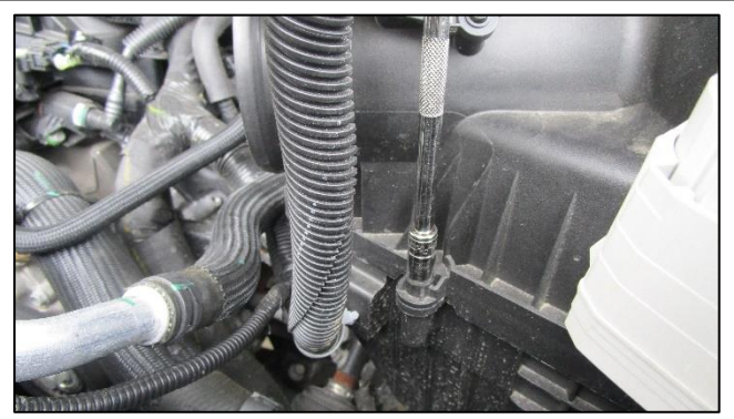
1. Remove three bolts securing factory air box upper portion to lower using a ratchet with extension and 8mm socket.