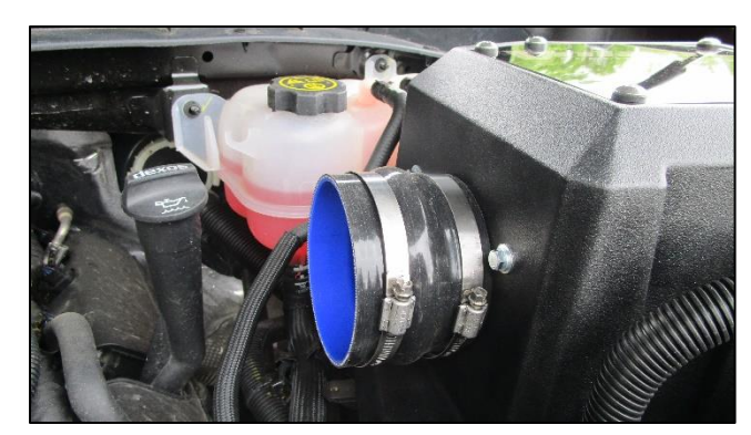
5. Place hump hose onto adapter with two of the included #64 clamps.

3. Install filter onto adapter in Volant air box. Tighten clamp using a ratchet and 8mm socket.