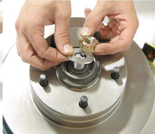
Outer Bearing Assembly

Note: Your conversion comes with two different castle nuts and two different grease seals. You only use the one set that is applicable to your car. Start by trying the black grease seal and short castle nut. If those do not work, use the other set provided.