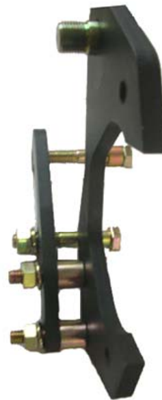
Passenger's Side, Rear View Off Of Car

Join the two brackets together using the \frac{3}{4} " spacers and the 2\frac{1}{2} " bolts provided in the kit. Tilt the main bracket up until the two holes in the lower corner match up with the two remaining holes in the support bracket. Insert the spacer between the two brackets and bolt them together using the aforementioned hardware. Torque the \frac{5}{8} " main spindle bolt using GM's factory torque specs for that bolt and then torque the two bolts that join the main bracket to the support bracket to roughly 50-60 ftlbs. With your hand move the spindle back and forth simulating the wheel turning. If necessary trim the excess threads off of the back of the forward steering arm bolt (the bolt without lock washer and nut) for control arm clearance.