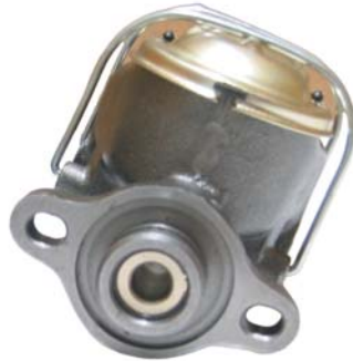
Deep Pocket Illustration

Note: Make certain that you have a deep pocket master cylinder. Make absolutely certain there is no plug in the back of the master cylinder and that you have a hole approximately 1" to 1 ¼" deep in the back of the master. See picture below.