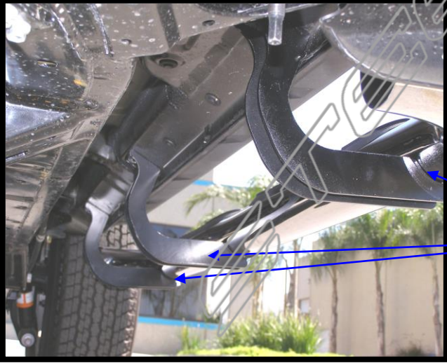
FIG. #2 DRIVER SIDE SHOWN