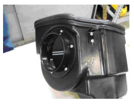
Step 8. Locate #3 "L" bracket. Install "L" bracket to JEGS air box. Using the supplied 10-32 SS machine screws, fasten the bracket to the front side of the JEGS air box. *Note: Install the head of the machine screws from the outside of the air box.