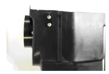
Step 9. Locate #14 Coolant Reservoir Bracket. Install the Coolant Reservoir Bracket. Using the supplied 10-32 SS machine screws, fasten the bracket to the back side of the JEGS air box. *Note: Install the head of the machine screws from the inside of the air box.