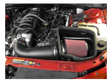
Step 14. Reinstall you engine cover and your installation is now complete!