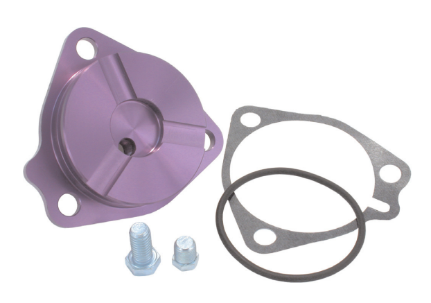
Billet Servo Cover, Gaskets & Hardware